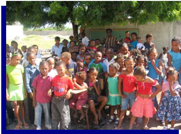
Children from the lunch program

Come to our Annual General Meeting. 7:30pm Nov. 15th, 2011 at the Whitby Public Library, 405 Dundas St.