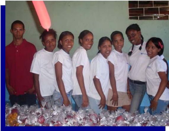
Some of the high school kids who participated in the program as youngsters return to volunteer