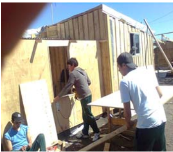
Rebuilding homes in Chile