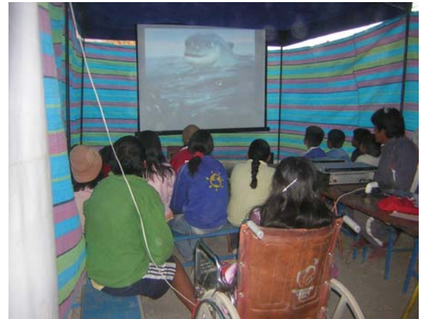
Watching the new multimedia projector

Thanks to your donations, the mobile library was able to purchase a multimedia projector and screen to aid in the delivery of their program. The projector is used to show presentations and films on culture and religion, and will be very valuable and useful in their future work. Your support also helped the library with purchasing materials and transportation costs.