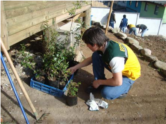
A student plants a garden as part of the rebuilding efforts