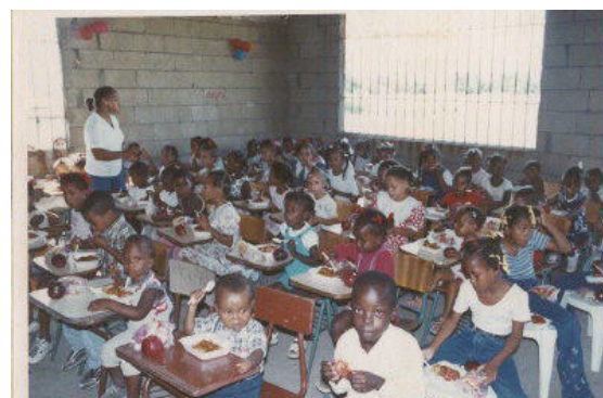
Lunch Program in 2003

This program provides a decent meal for at risk children, giving them the energy to learn. It also builds community and gives hope to families who struggle for a better life.