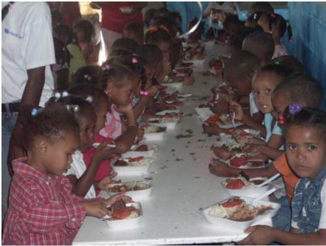
The young ones having lunch

This November 30, 2011 marks the 20 th anniversary of the lunch program. It has come a long way since its beginning in 1991.