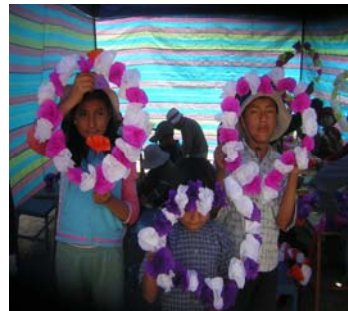
Children participating in the library program show off their creations

After the devastating earthquake that struck Chile in February of 2010, CAFE partnered with a local agency, named SEPADE, to support student-led reconstruction efforts.